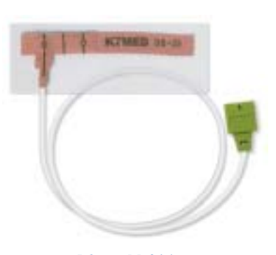
DS-03 : Multisite (Neonate, Infant, Pediatric, Adult)

Website: www.ktmed.com E-mail: master@ktmed.com