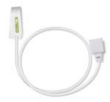
DS-04 : Clip-Multisite (Neonate, Infant, Pediatric, Adult)